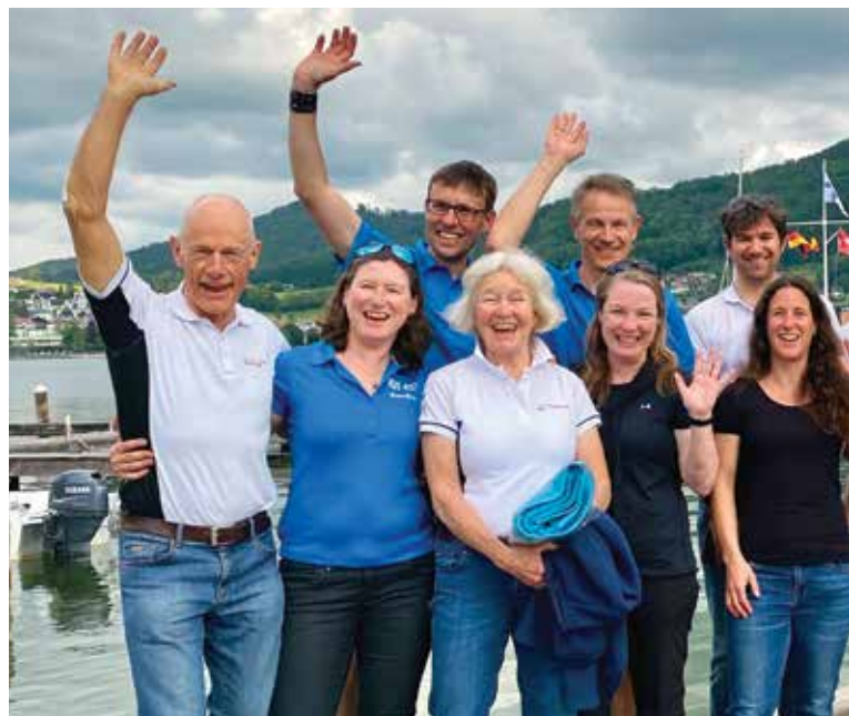
WORLDS GMUNDEN – MOST OF THE SUISSE SAILORS

On the other days we had a championship dinner at the lake, including a boat trip, and enjoyed our time in this beautiful city of Gmunden. The UYCT was a great host.