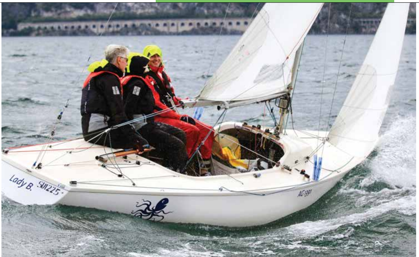
LADY B. ON LAKE GARDA AT THE 2018 WORLDS.

I wish you lots of fun equipping your new Yngling!