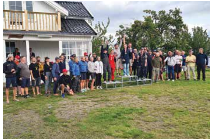
2024 NORWEGIAN NATIONAL CHAMPIONSHIP. TØNSBERG SEILFORENING