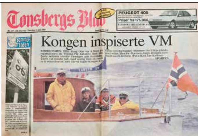
THE KING INSPECTED THE WORLD CHAMPIONSHIPS

More and more boats from many countries arrived and on July 7, the time had come: the race office opened,