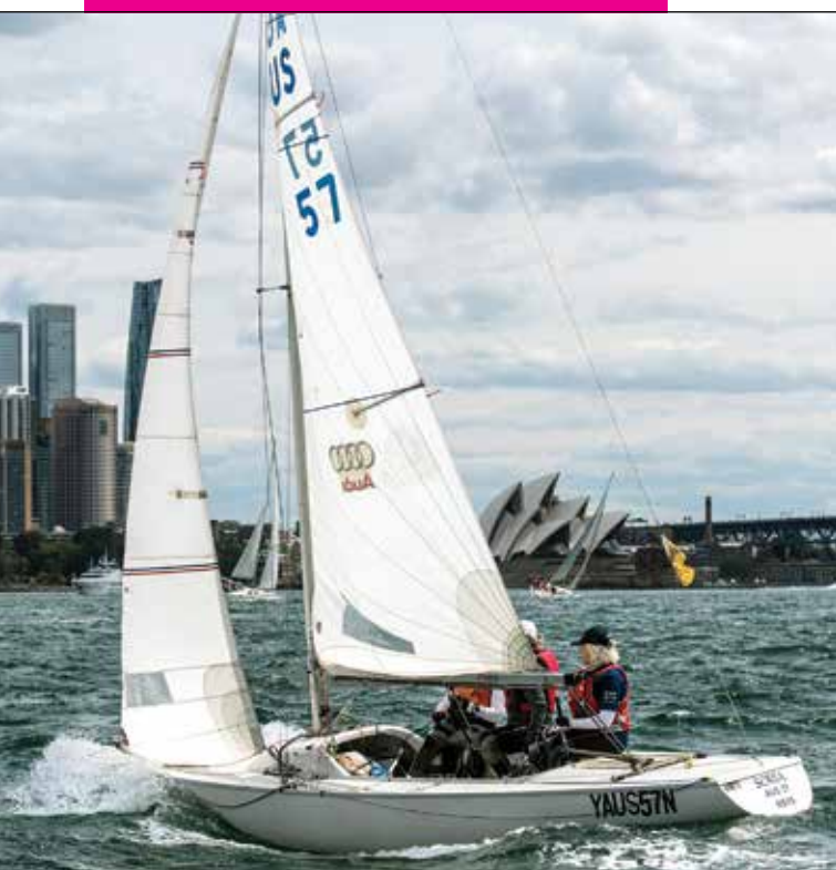
LADIES OF THE SEA COACHING REGATTA