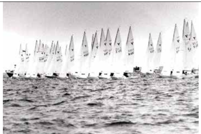
FULL SPEED AHEAD