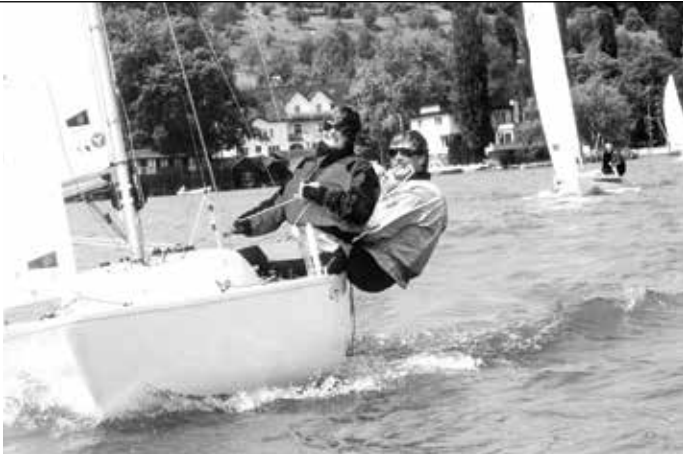
LADY B. IN 2002

The following article is about my experiences in equipping my Yngling SUI 447.