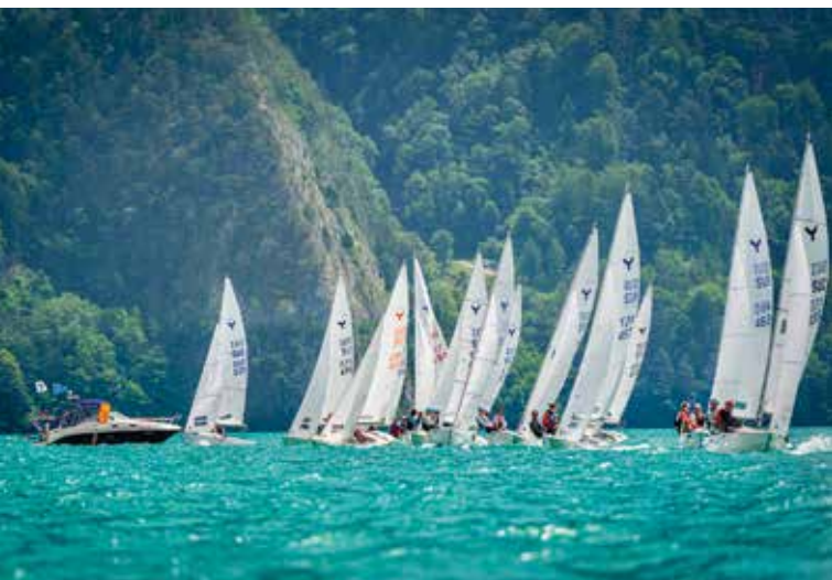
TOP: TRAINING AT THE REGATTA CLUB OBERHOFEN.