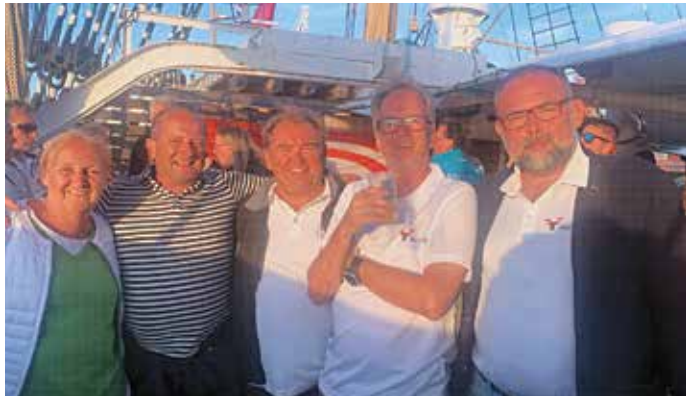
THURSDAY EVENING WE WENT TO THE PASSAT (A 4-MASTED BARQUE) FOR DINNER