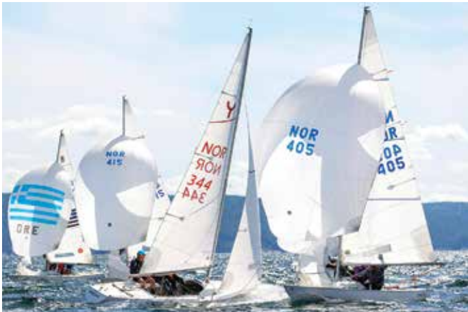
NORWEGIAN NATIONAL CHAMPIONSHIP.

This was an unpleasant surprise. Thanks to great efforts by Yngling Germany, we were able to secure Travemünde as the venue at short notice. We were there in 2014 and it was again a success in 2022. We were lucky, Travemünde had good wind conditions, on the Adriatic it was quite calm wind-wise. In any case, many thanks to the German Yngling Class for organising another World Championship one year after Berlin. And many thanks to the Worlds participants and their families for their flexibility, most of them were able to rebook to Travemünde.