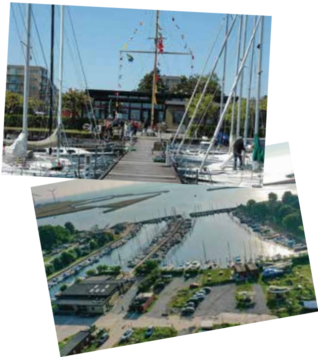
SUNBY SEJIFORENING, AMAGER

You simply can't miss the World Championships this year!