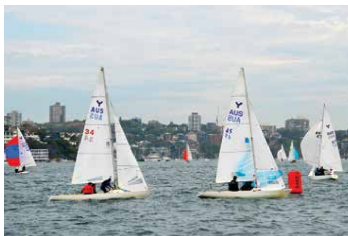
2022 AUSTRALIAN CHAMPIONSHIP