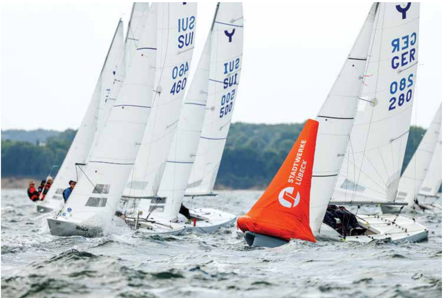
2022 YNGLING WORLD CHAMPIONSHIP.