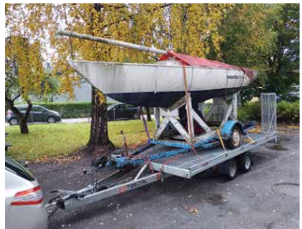
A RESTORATION PROJECT.