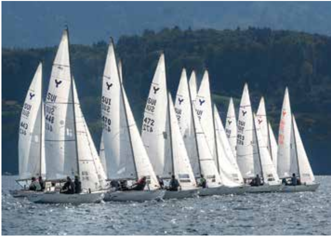
THE LIMA BATTLE.

Most recognised the advantages of the boat. The easy handling was mentioned above all, as well as the equal speed of the boats, so that tactical sailing was in the foreground. Of course, the Yngling class hopes that one or the other sailor could be won for the class.